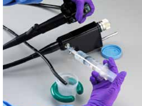
Sampling a Pentax® flexible endoscope