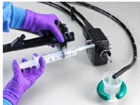
Sampling a Fujinon® flexible endoscope