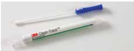
Test Point: Distal End