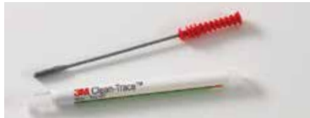
Test Point: Suction/Biopsy Channel