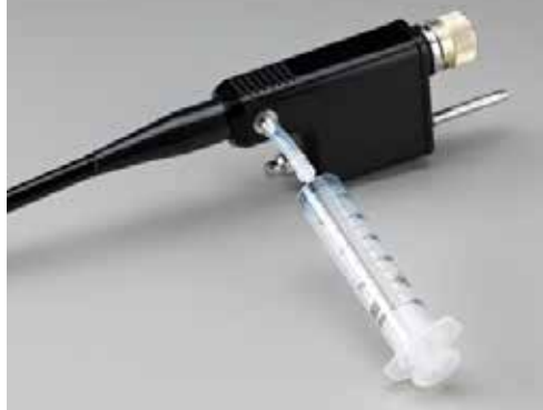
Placement of connector and syringe on Pentax® flexible endoscope