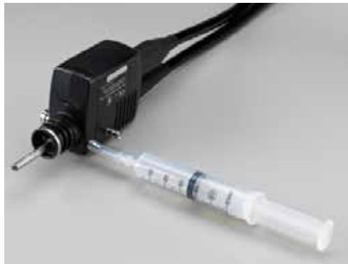
Placement of connector and syringe on Fujinon® flexible endoscope